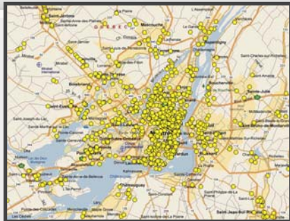
Number of Quebec locations: 1177