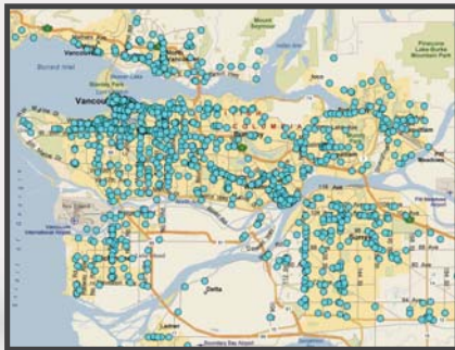
Number of British Columbia locations: 322