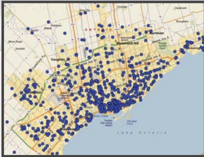
Number of Ontario locations: 2100